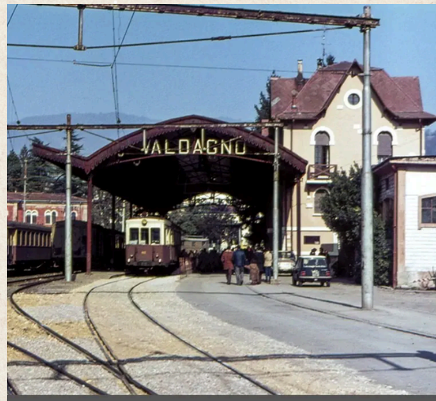
Valdagno bus station

Once you are already on board, after 1hour you should be in Valdagno, that means that you are getting closer to Recoaro (15min no much more), so keep your eyes open.