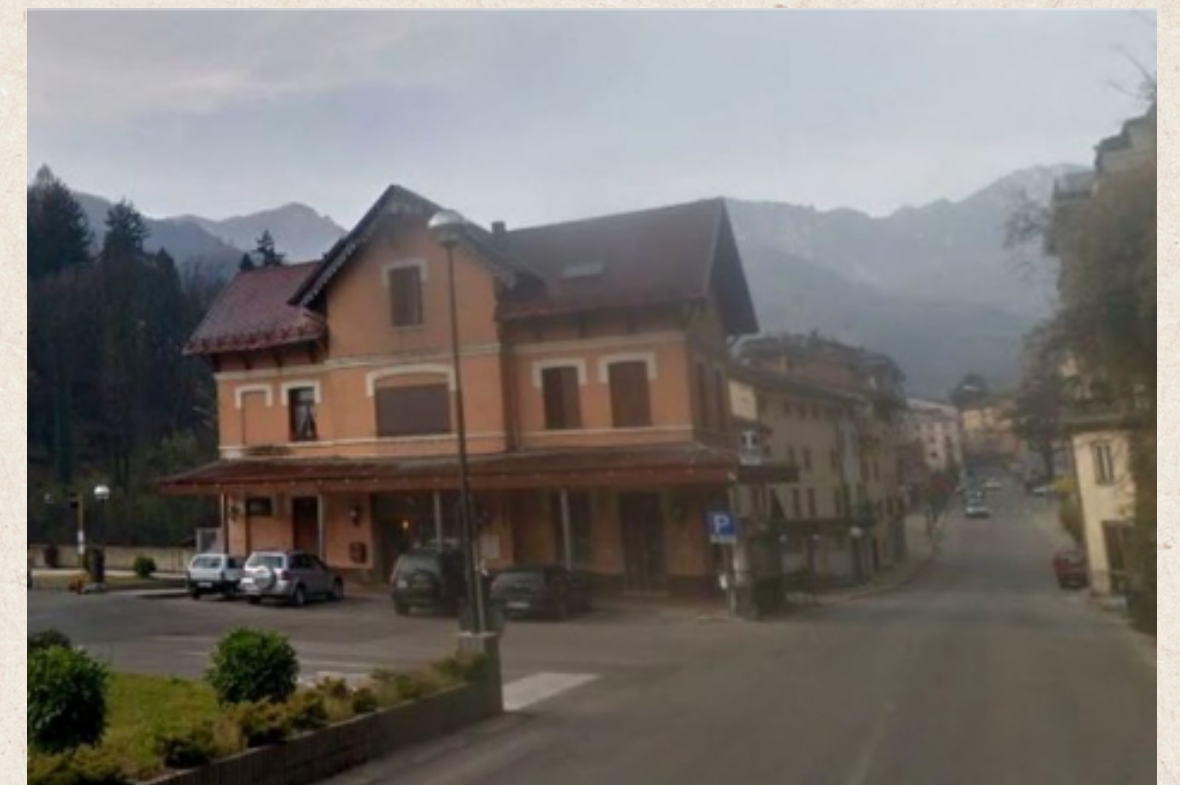
Recoaro bus station